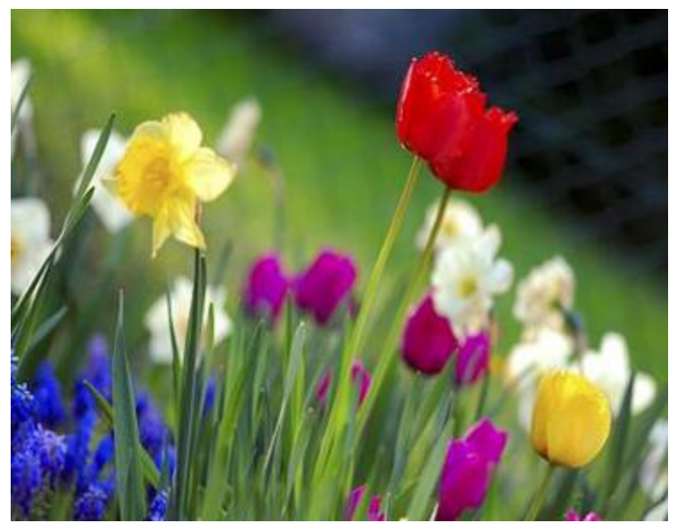
Beautiful spring in Syracuse, NY