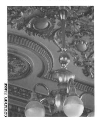
Ceiling detail from fourth Onondaga County Courthouse.