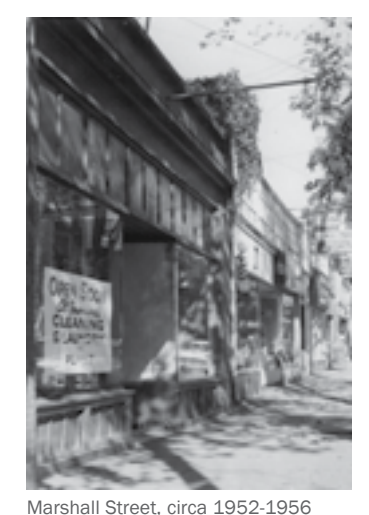
(Archives Image 15-0460)

photograph of Ivan Mestrovic's sculpture. Supplicant Persephone, is also included. Images like these are important because they offer a unique perspective. They document what a student wanted to remember during their time at Syracuse University.