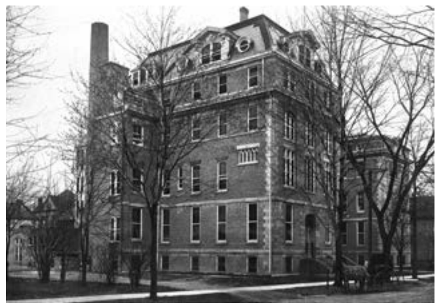
Huntington Hall (Archives Image 15-0461)

More information and a listing of SU buildings, past and present, can be found on our website archives.syr.edu/buildings/ .