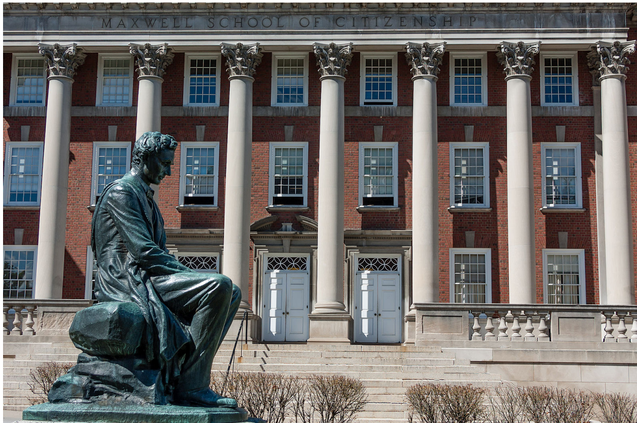
Maxwell School of Citizenship.