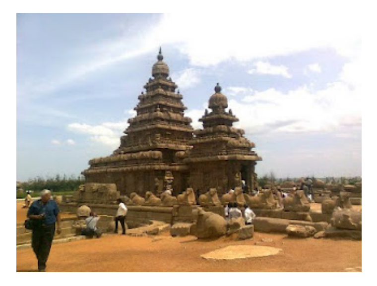
Figure III: Shore Temple in Mahabalipuram, India