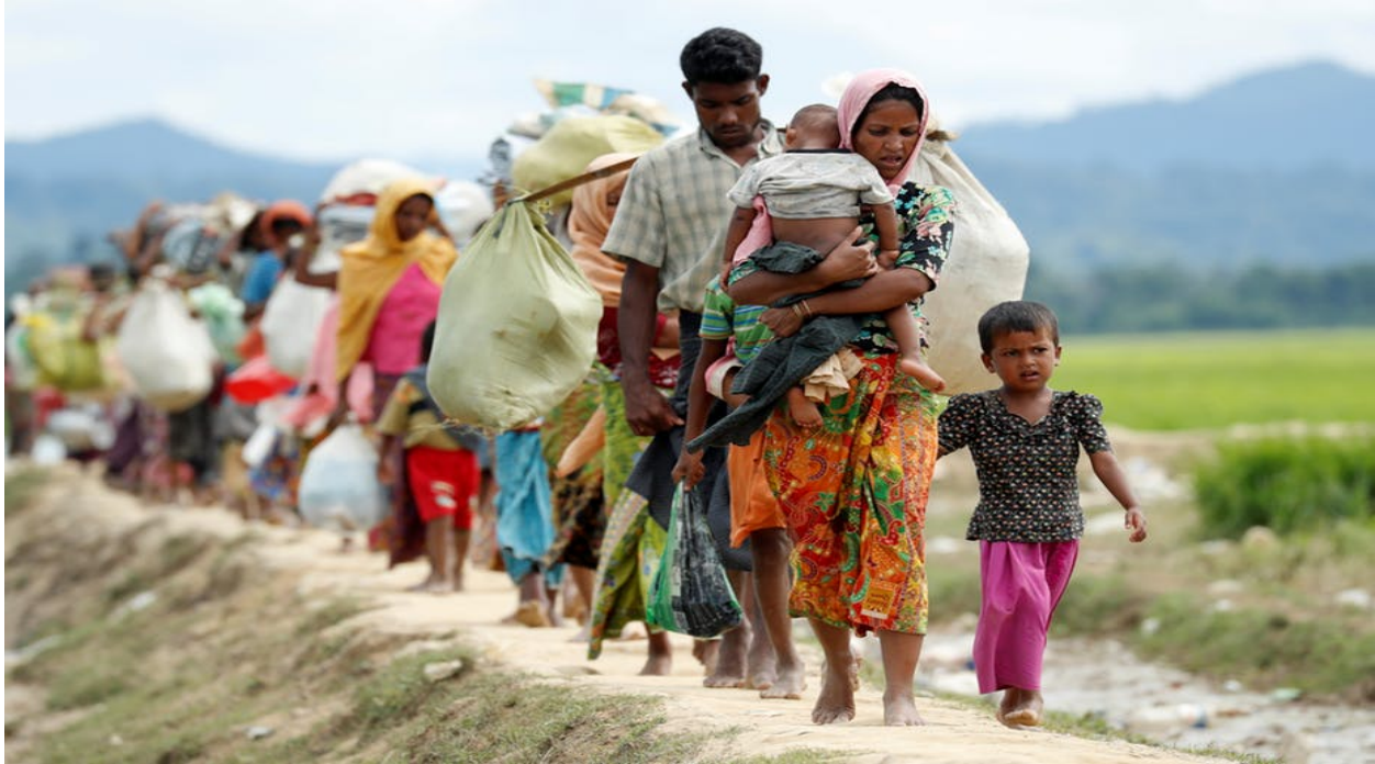
Rohingya refugees walk from Myanmar to refugee camps in Bangladesh.