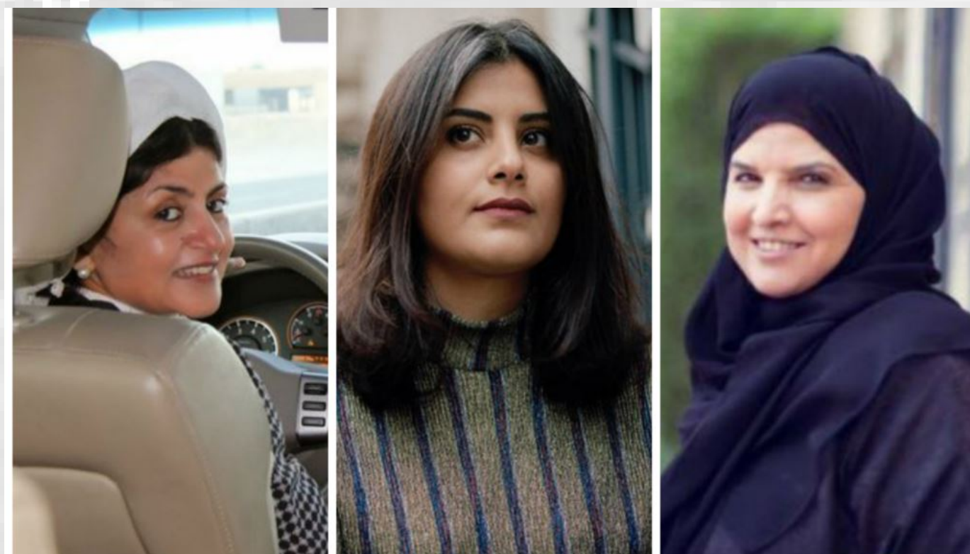
Fig.(2). "Saudi Activist Women" Saudi women who have been in jail for demanding to drive a car.