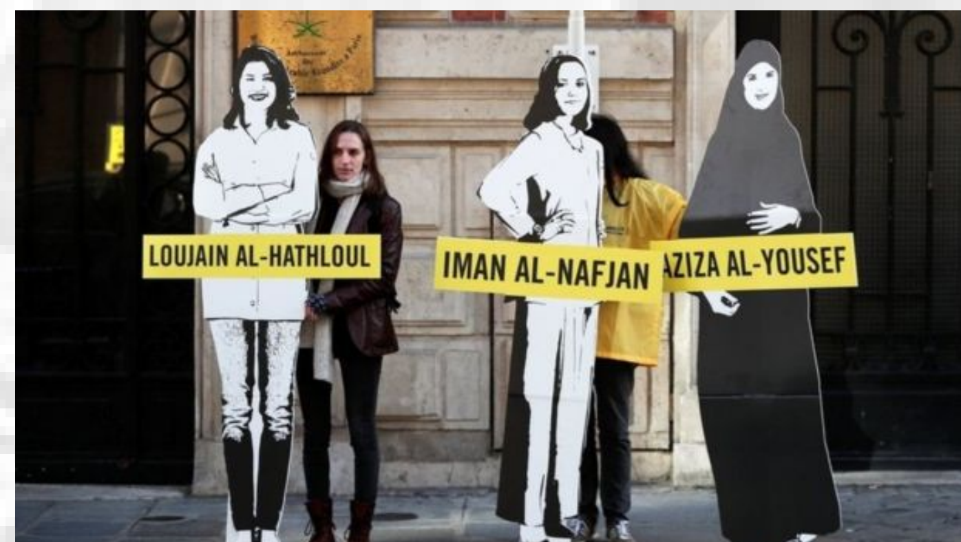
Fig.(3). "Trial of Women Saudi Activist to Open Wednesday" Amnesty International - women asking to release Saudi women from jail. (2019).