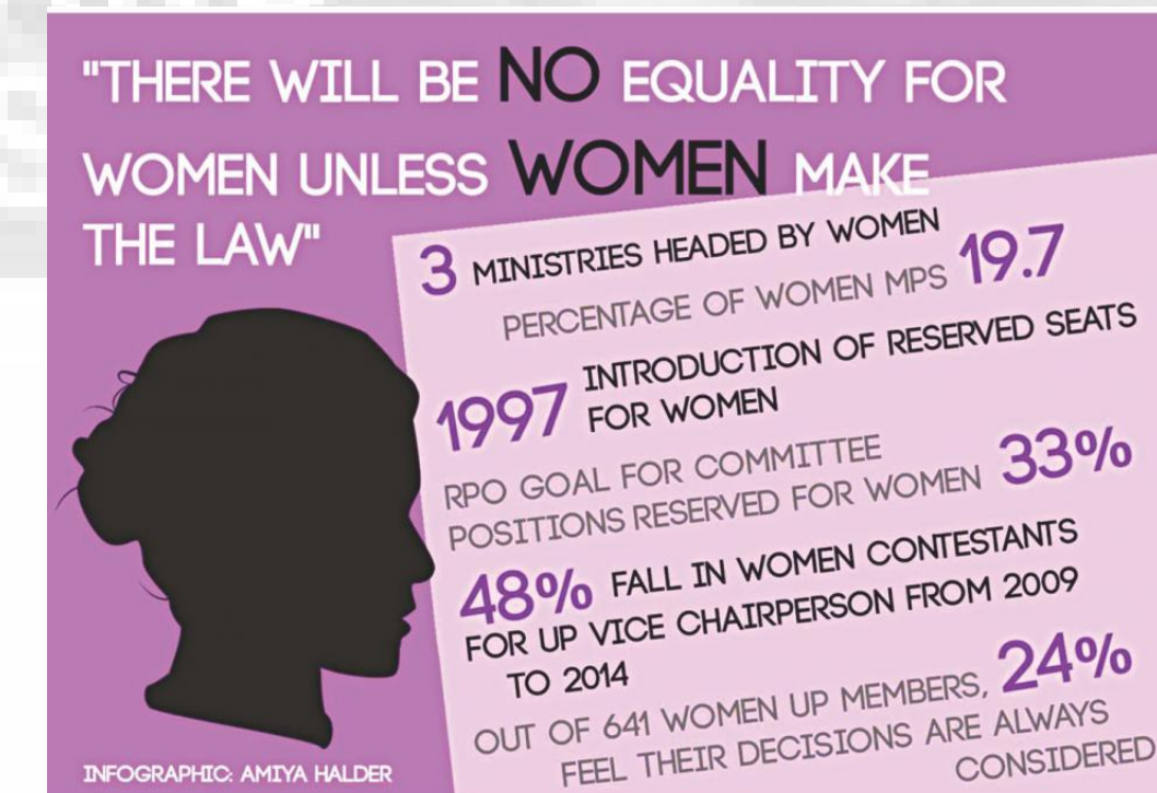
Fig.(5). This explains "the number of candidates female in Bangladesh aspiring to contest the upcoming Union Parishad (UP) elections is record high but these candidates are reportedly under pressure to withdraw from contesting elections from their male rivals".

Do you think the Middle East can achieve women's empowerment one day?