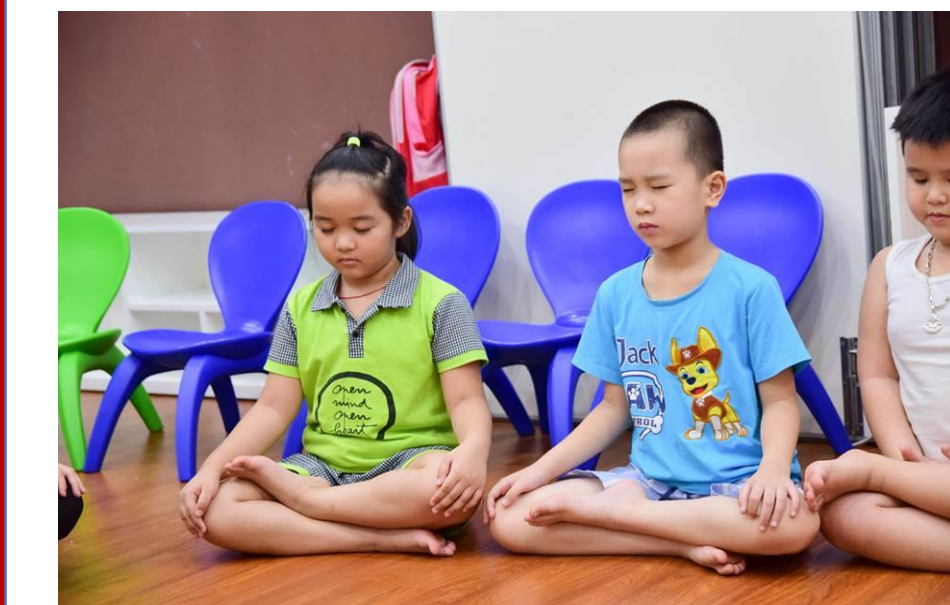
Students meditating before lesson.