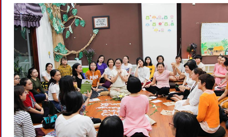
Teachers and some parents sitting and discussing mindfully and happily.