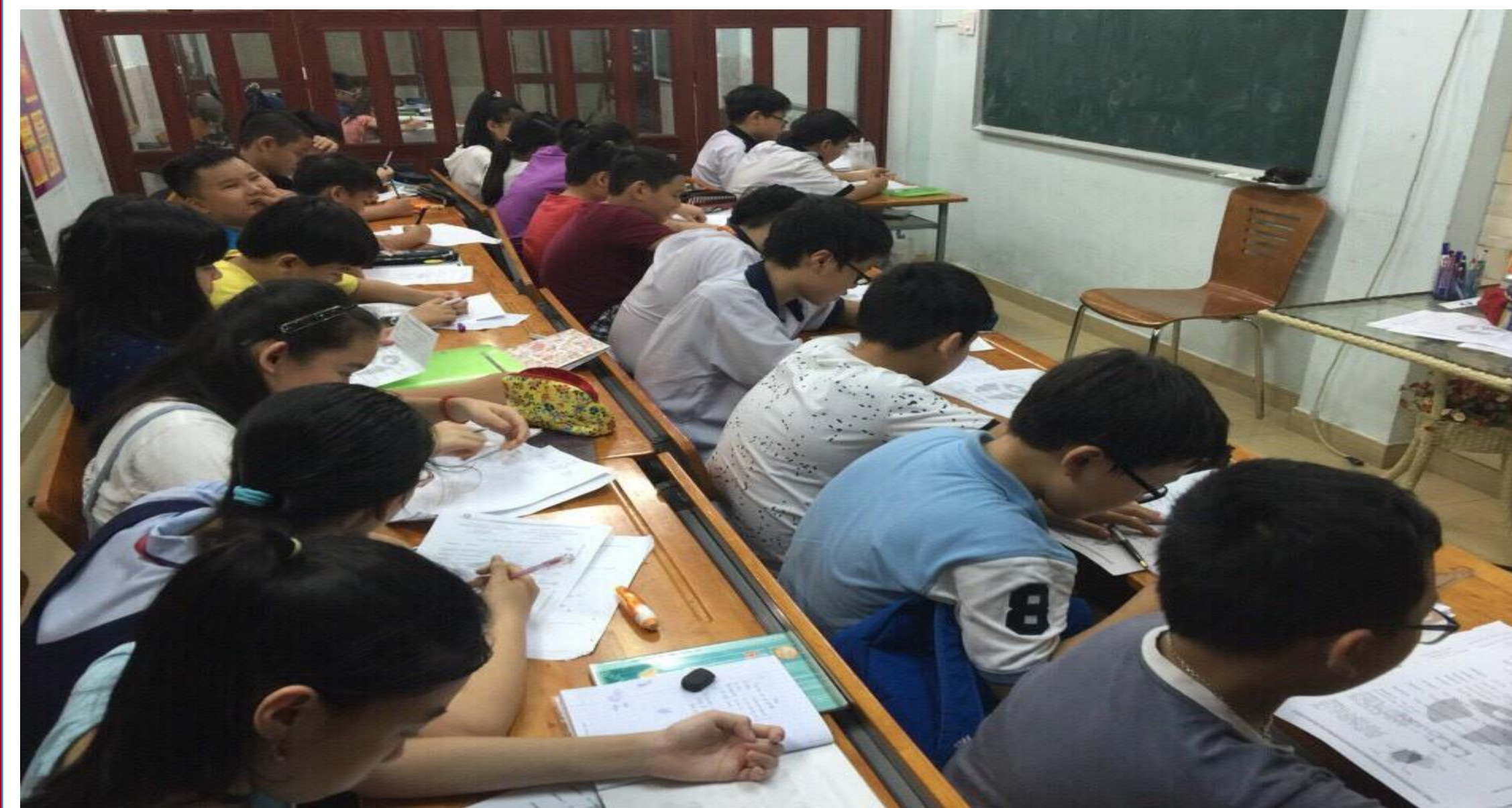
Students at extra class.