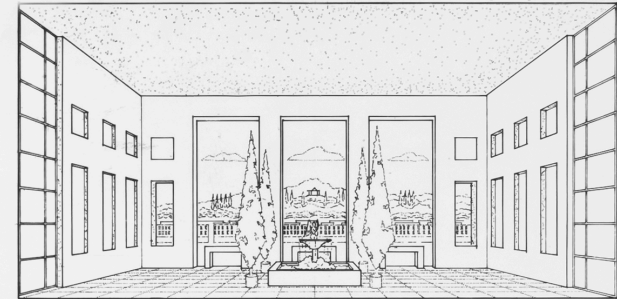
R E A D I N G T E R R A C E