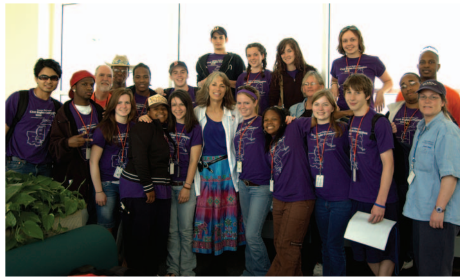
Students and staff participants pose for a final picture at the Syracuse airport after their arrival on June 5.