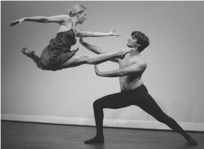
The Kennesaw State University Dance Company provides a valuable cultural resource in the face of diminished arts within local schools.