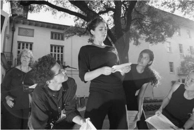
Living Newspaper performance at the dedication of a statue of Cesar Chavez, UT Austin campus, October 2007.

about how to ask and formulate questions, so that my students can go out and seek knowledge on their own... And we make sure that it is a back and forth interaction—an engagement between communities and scholars based on the assumption that both sides have knowledge that can be beneficial.”