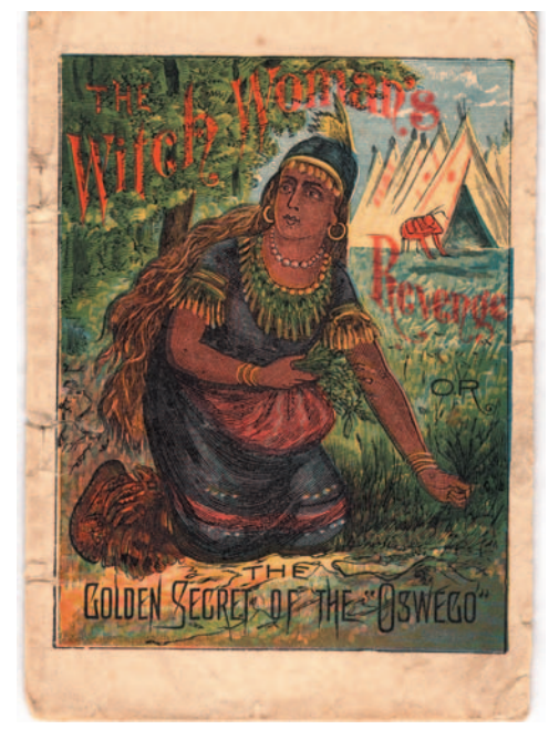
The Witch Woman's Revenge; or, The Golden Secret of the "Oswego" (Oswego, N.Y., 1882).