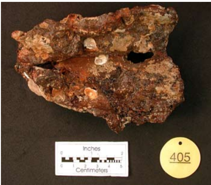
Figure 4. Blue seed bead concretion.