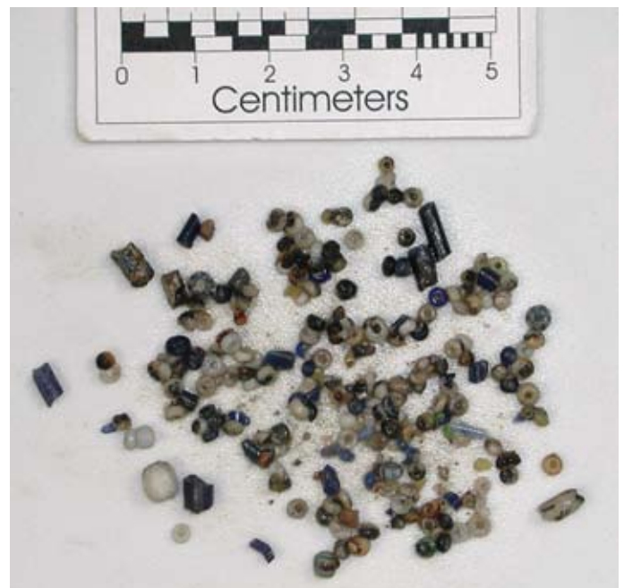
Figure 1. Beads from a European shipwreck off the coast of Elmina, Ghana.