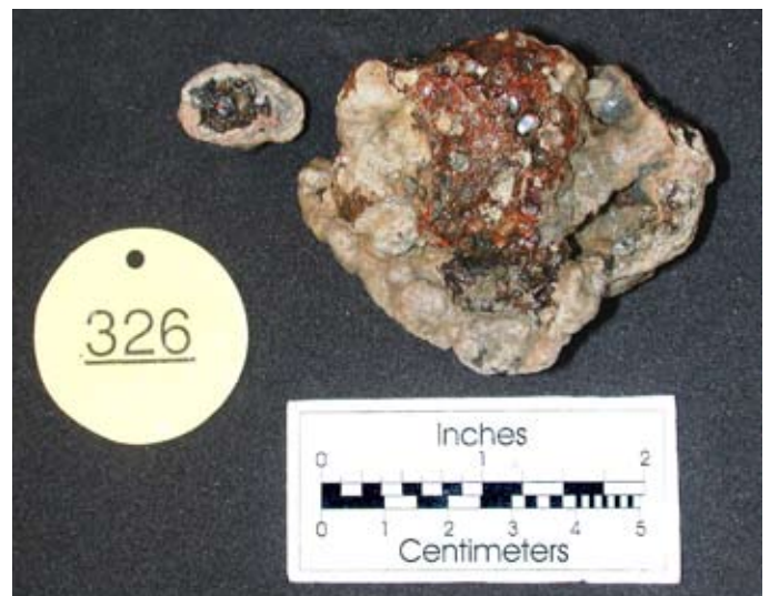
Figure 5. Striped bead concretion.

The latest typologies have had the most success in bead nomenclature and have incorporated additional features. Kidd and Kidd (1983), for example, completed their final typology publication in the 1980s. These bead researchers organized their typology by using bead manufacture and physical attributes, assigning each bead an alphanumeric label designed to allow easier comparisons. As other researchers find beads different from the ones presented by the Kidds, each new bead should receive a new type designation. An example is Kidd designation IIa7, which is understood