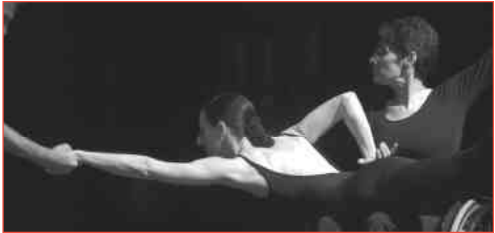
Members of Verlezza Dance performed at Kent State University as part of their Symposium on Democracy, held annually in May. The theme of this year's Symposium was "Democracy and the Arts: Voices and Choices." Their performances include both "stand-up" and "sit-down" dancers, and demonstrate the inclusiveness and diversity of dance.