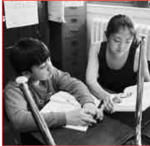
A member of the Latino Scholars Program tutors a student from Roosevelt School, in the New Brunswick Public School system. The Latino Scholars Program is a project of the Center for Latino Arts and Culture of Rutgers University.

Recognized by President Clinton in 1993, Rutgers'Citizenship and Service Education (CASE) program is an effort to make service-learning central to the undergraduate curriculum. With the launch of njserves.org , CASE's Internet one-stop shopping portal for the New Jersey civic sector, CASE has become an important direct service provider to citizens, civic organizations, government and New Jersey businesses.