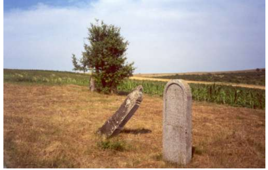
Asuaju de Jos cemetery.