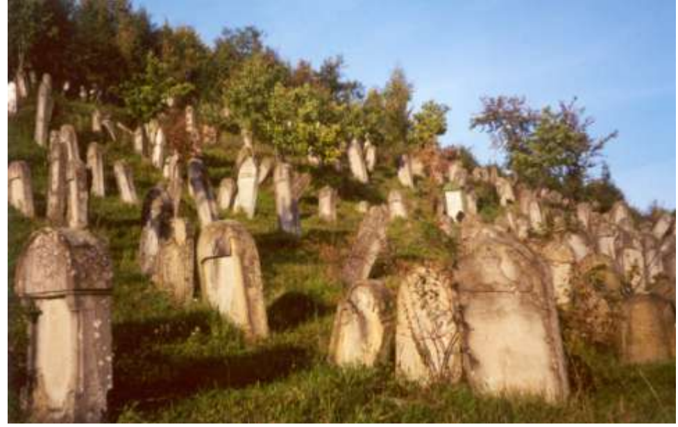
Viseu de Sus cemetery.