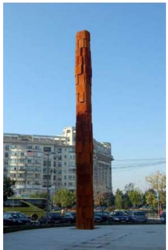
The Column of Endless Life. "Remember" is written on the top of the column in Hebrew.