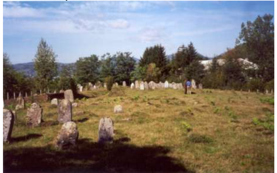
Crasna Petrova cemetery.