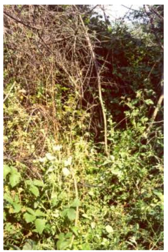
Oarta De Sus cemetery.