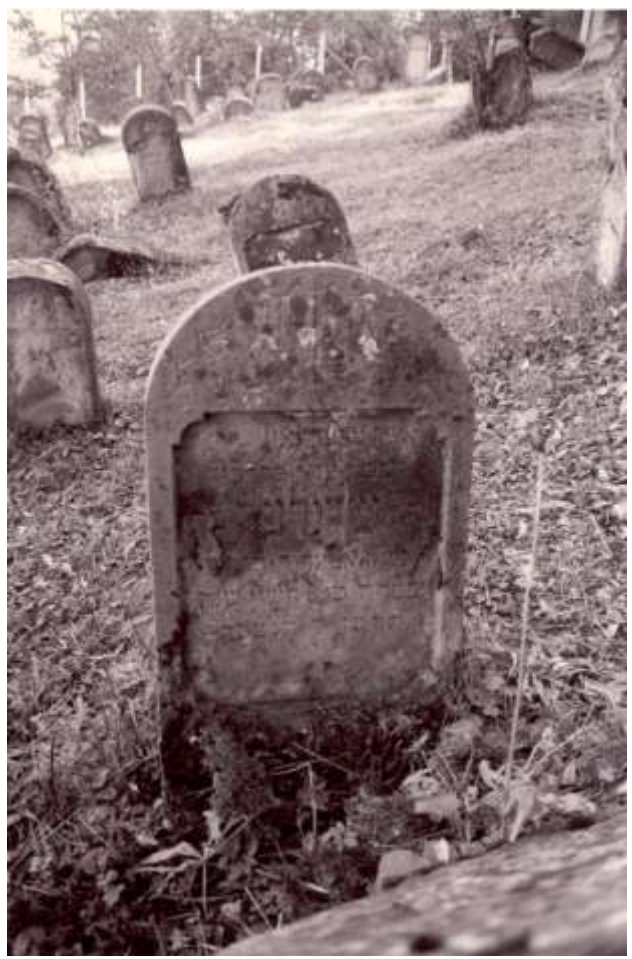
Viseu de Jos cemetery.