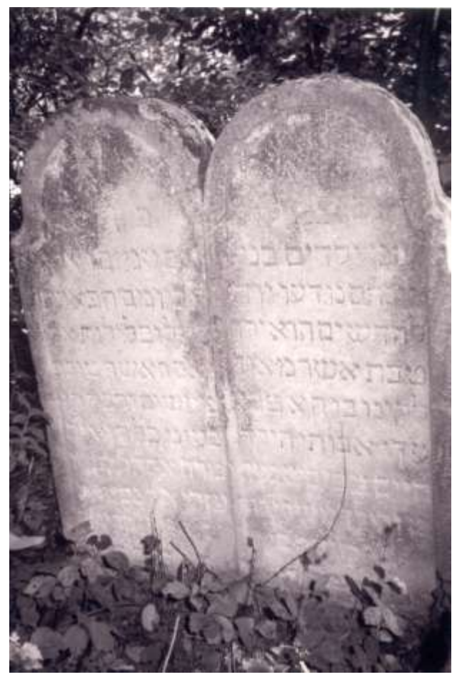
Oarta De Jos cemetery.