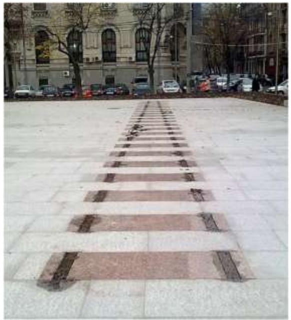
Symbolic railroad tracks used to transport the victims.