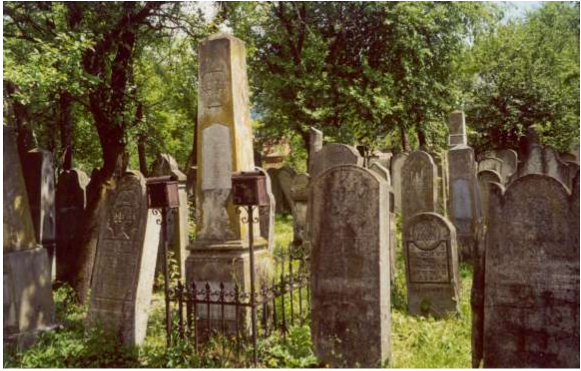
Cimpulong Moldovenesc cemetery.