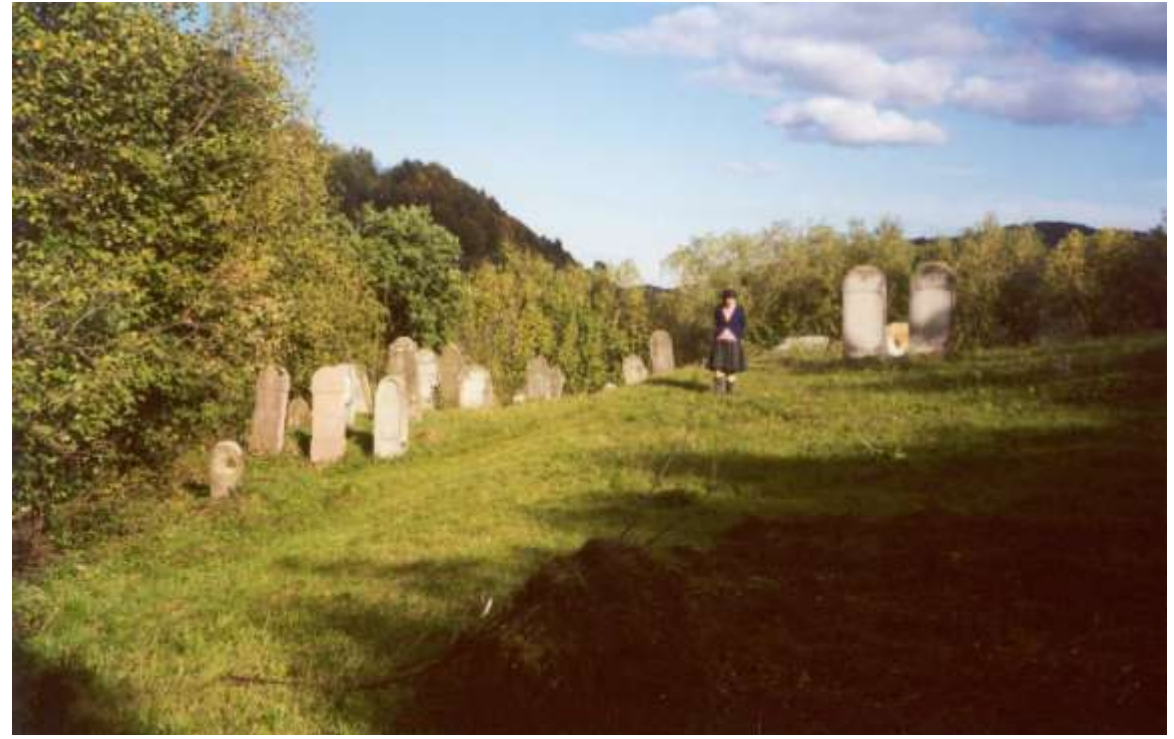
Poinele Izei cemetery.