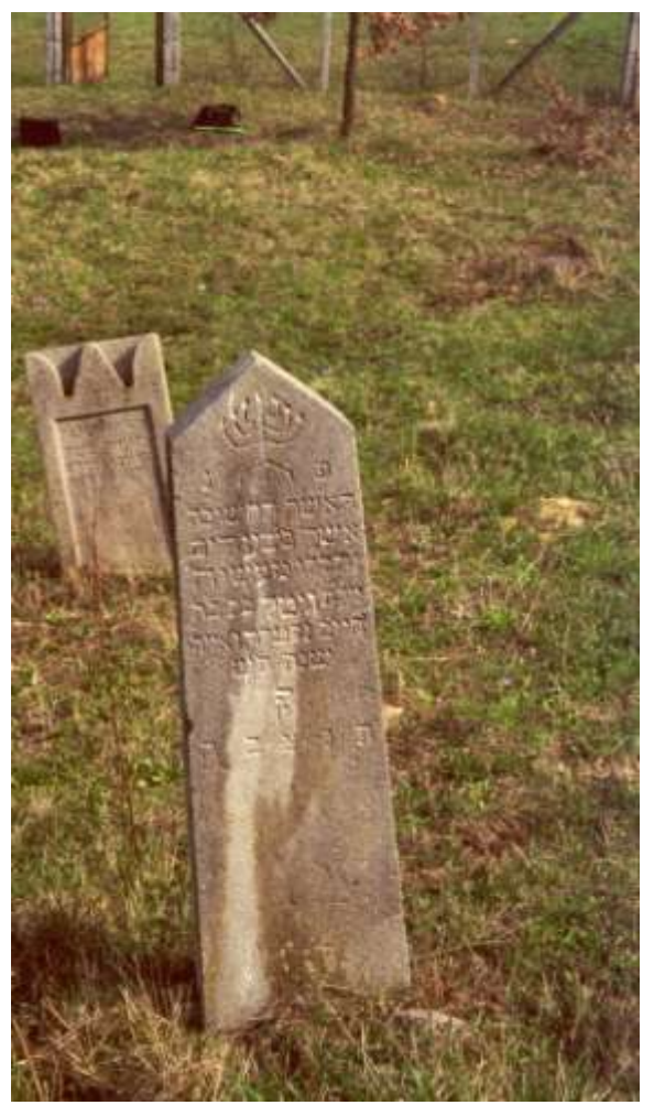
Copalnic Maramures cemetery.