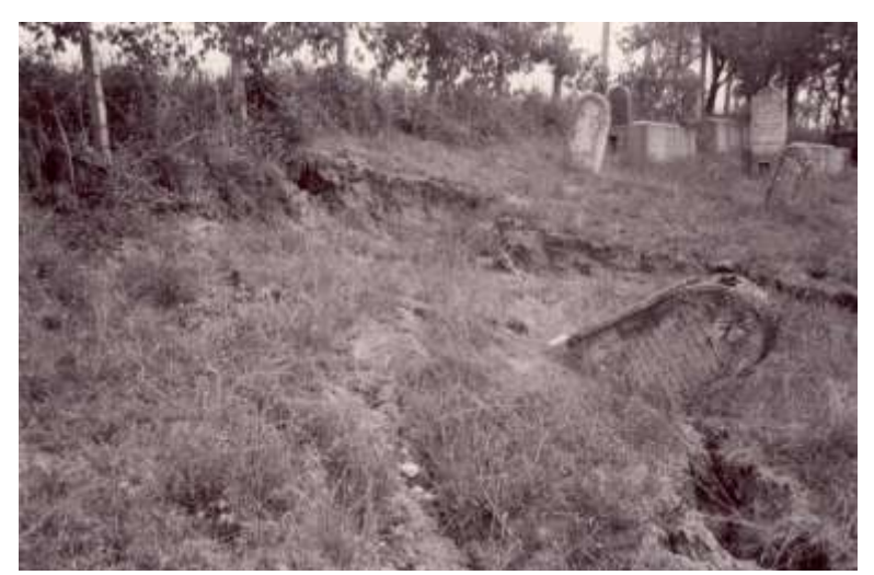
Baita de Sub Codru cemetery.