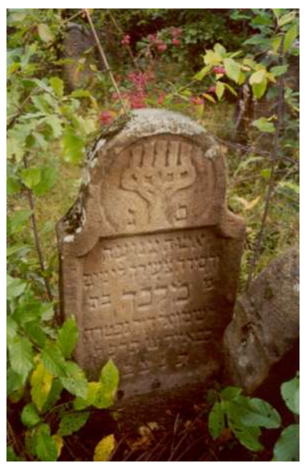
Cimpulung la Tisa cemetery.