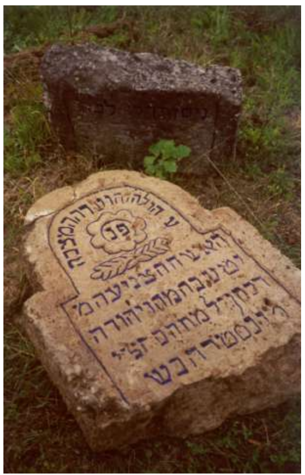
Tauti Magheraus cemetery.