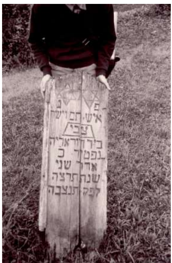
Ruscova cemetery. Rare surviving wooden grave marker.