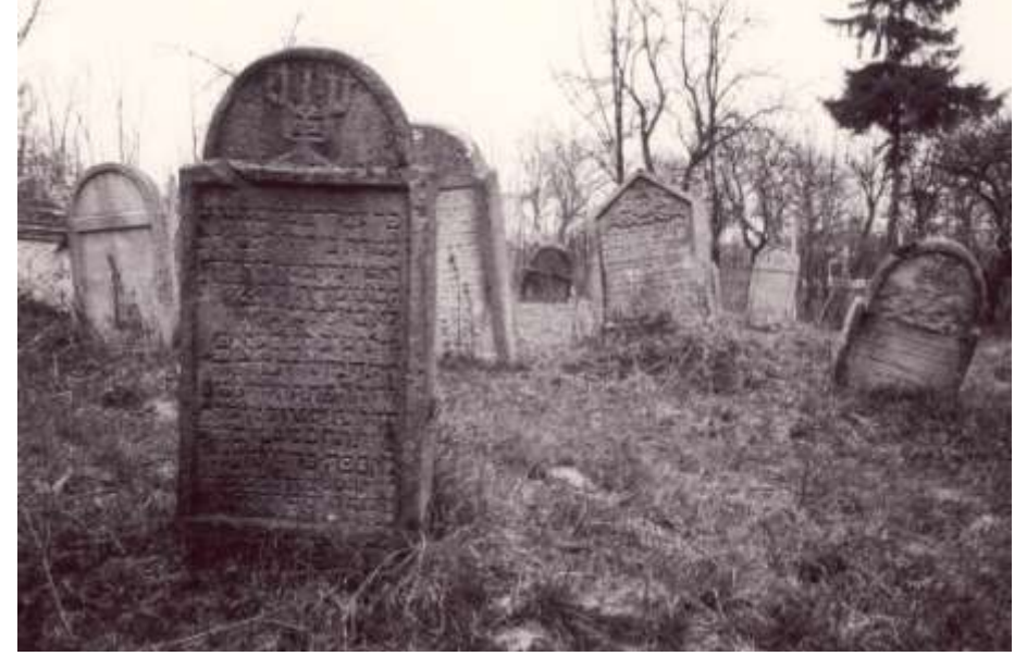
Copalnic Manastur cemetery.