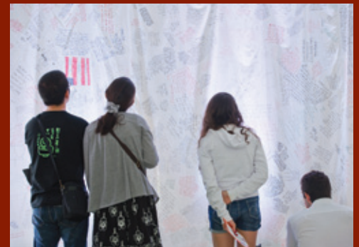
SU students view the Sheets of Expression

This year marked the 10th Anniversary of the September 11, 2001 terrorist attacks. Hendricks Chapel sponsored a Service of Remembrance and Hope, a lecture series featuring topics on living in the aftermath of tragedy, and a public service event done in conjunction with the Better Together initiative. Students, faculty, and staff were asked to donate canned goods that were given to the Interreligious Food Consortium, which serves 70 local food pantries. Students could also bring their canned goods to Juice Jam where part of the proceeds from the concert went towards famine relief in the Horn of Africa.