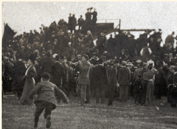
Bleachers Collapse at Star Park, 1906