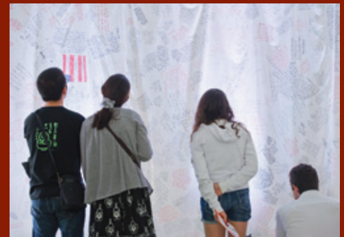
SU students view the Sheets of Expression

This year marked the 10th Anniversary of the September 11, 2001 terrorist attacks. Hendricks Chapel sponsored a Service of Remembrance and Hope, a lecture series featuring topics on living in the aftermath of tragedy, and a public service event done in conjunction with the Better Together initiative. Students, faculty, and staff were asked to donate canned goods that were given to the Interreligious Food Consortium, which serves 70 local food pantries. Students could also bring their canned goods to Juice Jam where part of the proceeds from the concert went towards famine relief in the Horn of Africa.