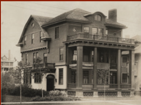
113 Euclid Ave., circa 1920. Note the 2-story front porch, since removed.

As some of the most popular questions posed to the Archives involve University buildings and architecture, we maintain a listing of SU buildings, past and present, on our website at archives.syr.edu/buildings/ . We are currently updating and expanding the information offered. Future issues of Access will feature buildings that have reached a milestone date, such as the one pictured here.