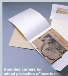
Rounded corners for added protection of inserts