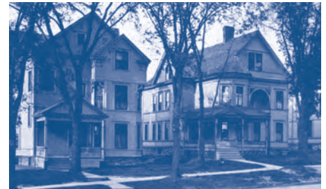
Parker Cottage on the right.

A number of students were passing by at the time and Philip Lightall and Ernest Knodel volunteered to go up and put out the blaze. The upper hall was filled with dense smoke. The students went into the room and began to throw the burning things from the window. While they were doing this, Mrs. Scott, together with two girls in the house, carried buckets of water to the men with which to extinguish the flames. One of the girls ran over to the cottage next door and got a fire extinguisher. With this and the water the men put out the blaze before it was necessary to call the fire department.