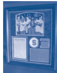
2003 Syracuse men's basketball team commemorative plaque, which includes an actual piece of the hardwood court from the Carrier Dome.

Archives has already begun scanning images of SU football legends Jim Brown, Ernie Davis, Larry Csonka, Tim Green, Floyd Little, and Art Monk for possible use by Syracuse Steiner Collectibles. Basketball greats Pearl Washington and Dave Bing